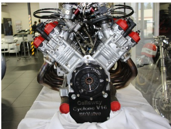
Callaway V16 Racing Engine