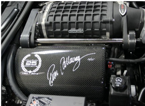
Supercharged Callaway Motor