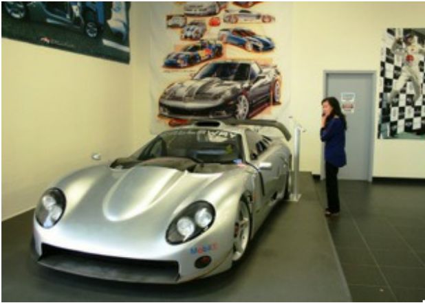
Callaway Race Car