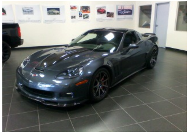
Callaway C6 Corvette